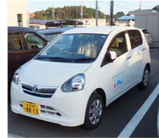
The donated doctor car