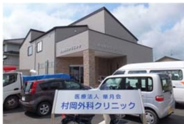
Muraoka Clinic opened in May