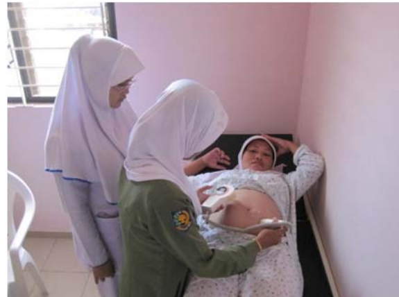
Periodical examination at a health clinic