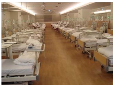
60 units of dialysis equipment