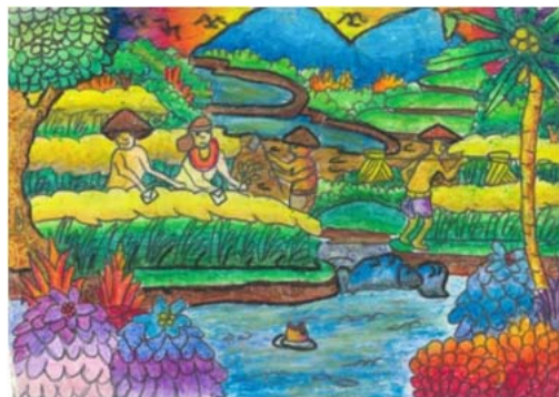
Drawing from Cambodian tale “A hermit reviving a tiger”