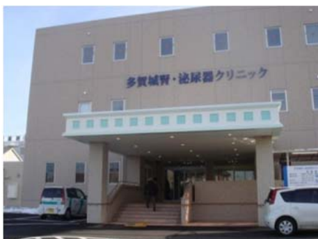
The new clinic

In January this year, a generous philanthropist offered to donate through PHJ a body composition analyzer, extracorporeal shock wave lithotripsy, and endoscope sterilizer to the clinic. Thanks to this donation of the expensive equipment that the clinic wished to have, it is able to extend efficient medical care services and doctors, nurses and patients express their gratitude to the donor. The expenses for maintenance and renewal of these equipment will be born by PHJ with a designated donation trust of Sumitomo Mitsui Trust Bank the same donor entrusted. PHJ is confident that the clinic will continue to extend quality medical services.