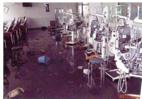
The damaged equipment

Medical doctors, nurses, and patients expressed their gratitude as follows: