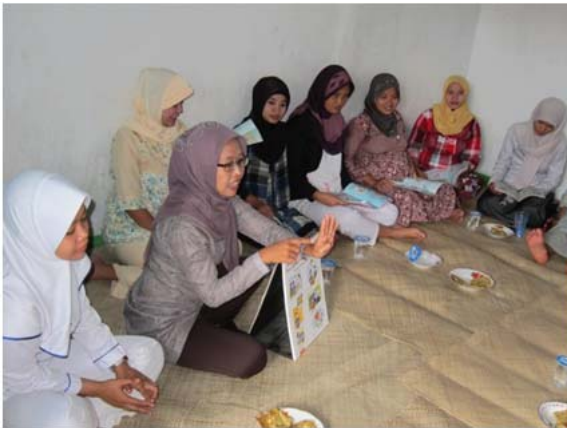
Health education to expected mothers