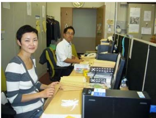
Photo: Two employees of Salesforce.com Co., Ltd. enclosing newsletters to envelopes