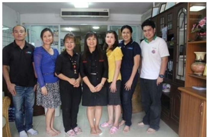
PHJ Thailand Office in Chiang Mai and the PHJ Thailand staffs