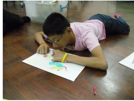
Photo: A Thai child draws a fairy tale of Horse-faced Princess