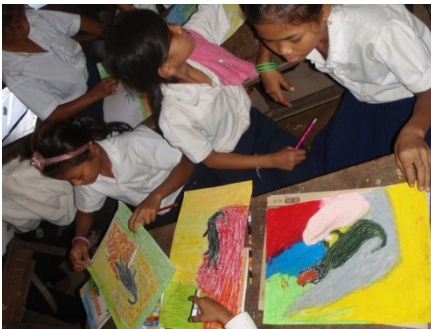
Photo: The Cambodian children drawing the picture of a rabbit fairy tale

The fairy tale calendar series continued for five years till the 2015 calendar. PHJ is planning to start a new series of animal parent and child with the 2016 calendar using the drawings by the children of Thailand, Cambodia and Musashino City, Japan.