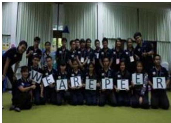
Peer Educator’s Training